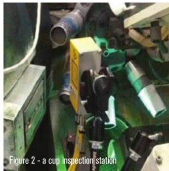
Figure 2 - a cup inspection station

in multiple production facilities in several countries, with a total of 11 systems operating 24 hours a day. Compact size and simple set-up make the system well suited for retro-fitting to existing lines. Although achieving 100% quality control is a universal challenge, it is absolutely critical for maintaining the highest standards for food packaging plants. Thanks to cutting edge developments in 3D scanning and inspection technology, sensors can now solve the challenges of 100% inspection of food containers in high speed production facilities. Automated inspection and sorting eliminates the cost of manual inspection and provides absolute confidence that every cup produced meets customer expectations, providing a dramatic improvement in product quality.